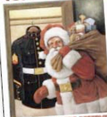
U.S. MARINE CORPS RESERVE

HCCU will once again be accepting donations for Toys-For-Tots. Drop boxes will be set up at both credit union branches.